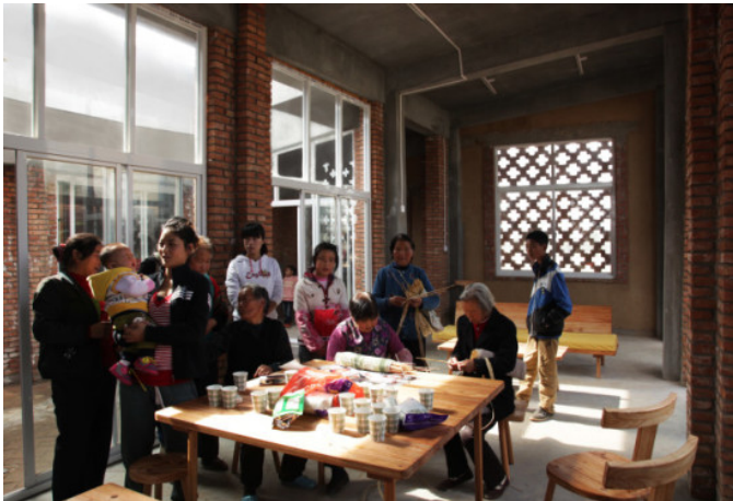
The shijia prototype house is used as a women's shelter and handicraft center for straw-weaving. (rural urban framework)