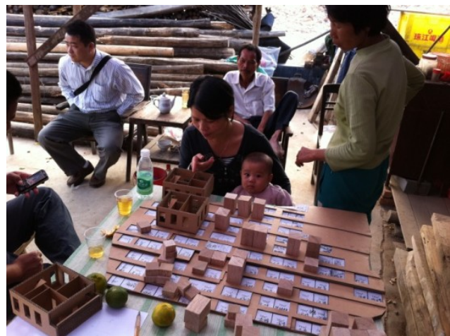
After interviewing families in the village, ruf created a prototype with four functional courtyards inserted throughout the house to relate to the main functional rooms: kitchen, bathroom, living room, and bedrooms. (rural urban framework)