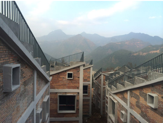
Rural Urban Framework's Jintai Village homes were developed with stepped roofs to be planted with gardens

hospitals, houses, and even a garbage collection center. To date, RUF has worked in 18 villages to combat the effects urban sprawl and is designing and planning entire villages and prototype housing.