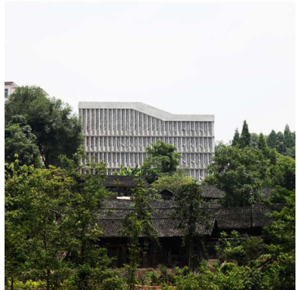
Rural Urban Framework's Andong Village charitable hospital

Working closely with the locals, RUF has completed a variety of projects to meet each community's specific needs, including bridges, schools,