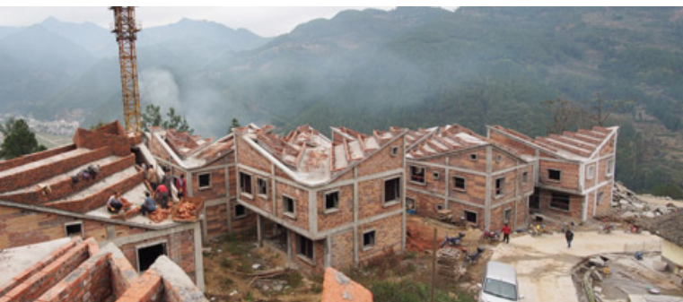
Rural Urban Framework constructed new houses in Jintai Village following the 2008 earthquake and 2011 landslide